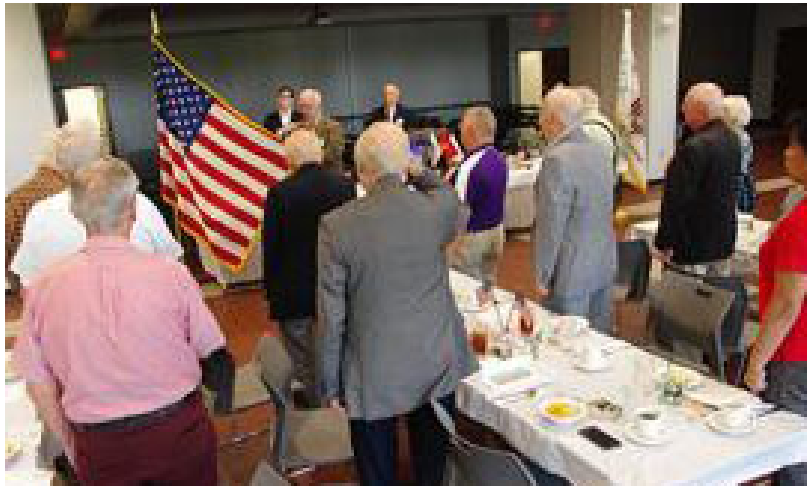
Pictured at left are Heart of America MOAA and Auxiliary Members as they Pledge Allegiance to the American Flag at the beginning of the meeting