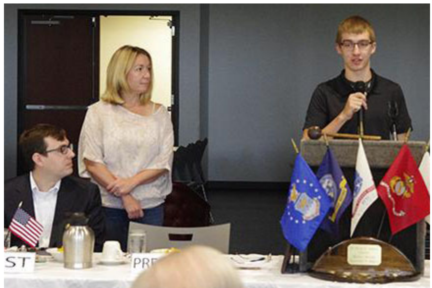
Pictured is one of the Chapter's 2017 Scholarship Recipients thanking the Chapter and Auxiliary for the scholarship