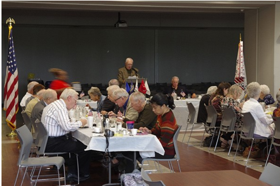
Our Meeting last month