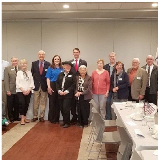
October guests at the October meeting