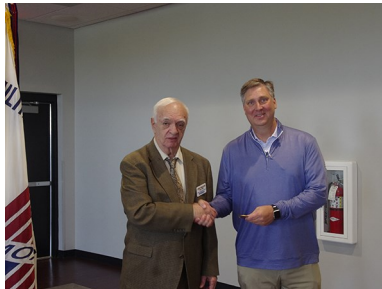
APRIL MOAA GUEST SPEAKER